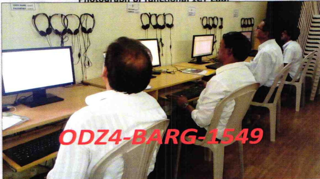
Photograph of functional ICT Lab:

H. Nodal Stamp & Signature of HM Talmenda Nodal High School