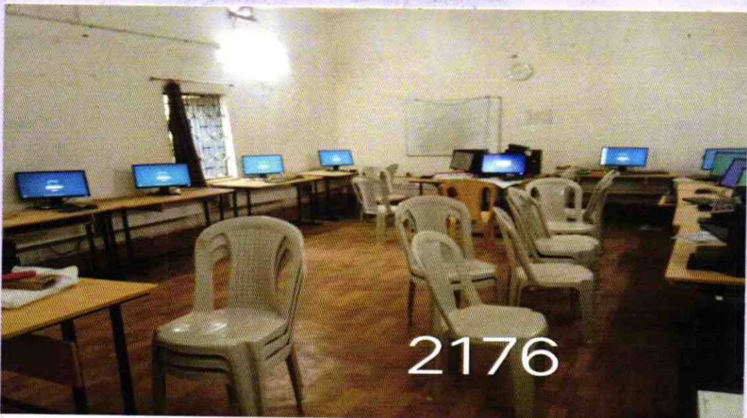
Photograph of functional ICT Lab:

Stamp & Signature of HM 100th (New) Girls High School Bangomunda