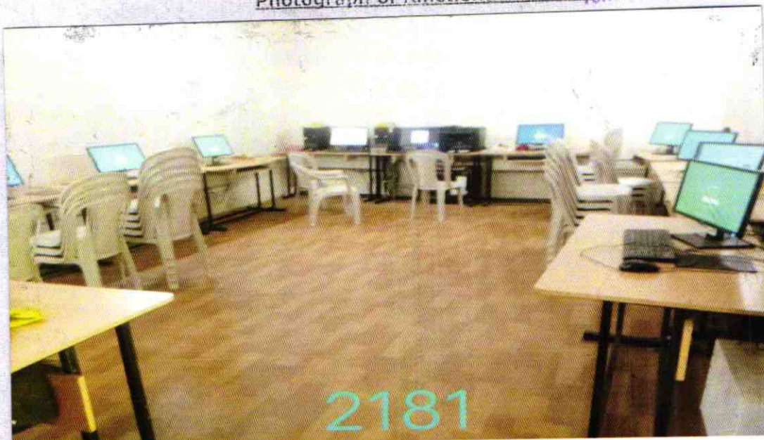
Photograph of functional ICT Lab

Headmaster J.R.M. Nodal High School Pentulimunda (Govt. New)