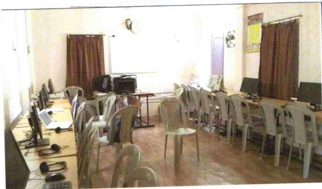
Photograph of functional ICT Lab:

[Signature] Headmaster G.S. Durguripali Nodal High School Govt. (New), Dist. Balangir