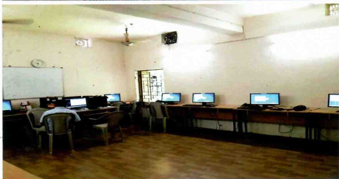
Photograph of functional ICT Lab: Chamakhandi (Gm.)

Radhakesh Mishra 20-08-18. Headmaster Stamp & Signature of HM Chamakhandi Nodal High School