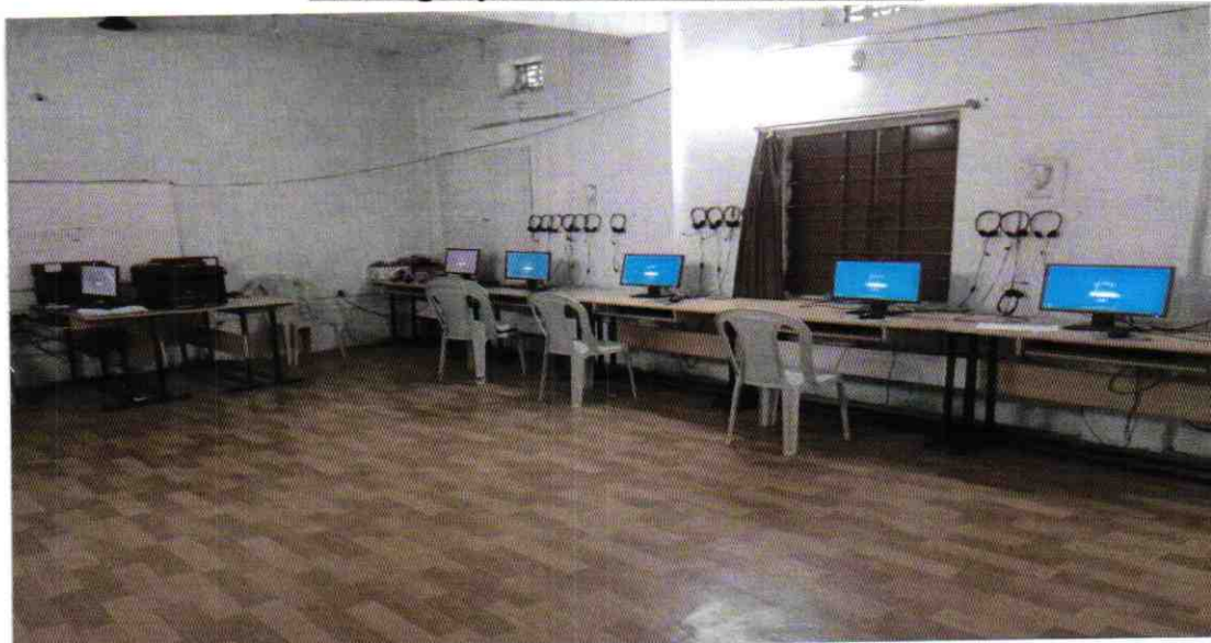
Photograph of functional ICT Lab:

29.8.2019 Headmistress Stamp & Signature of School Lingaraj Girls' High School Polasara-761105