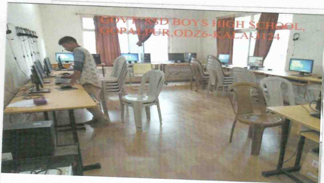
Photograph of functional ICT Lab:

[Signature] Headmaster 20/8/19 Stamp & Signature of Headmaster, Kalabandi