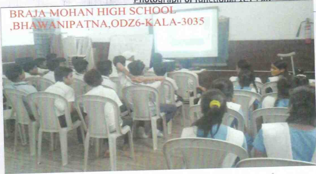
Photograph of functional ICT Lab:

Bhawanipatna 26.8.19 HEADMASTER Stamp & Signature of HM Bhawanipatna