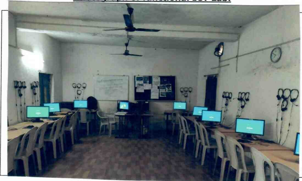
Photograph of functional ICT Lab:

S. Panigrahy 11.09.19 Headmaster GOVT. NODAL HIGH SCHOOL Murtuma, Dist. Nabarangpur