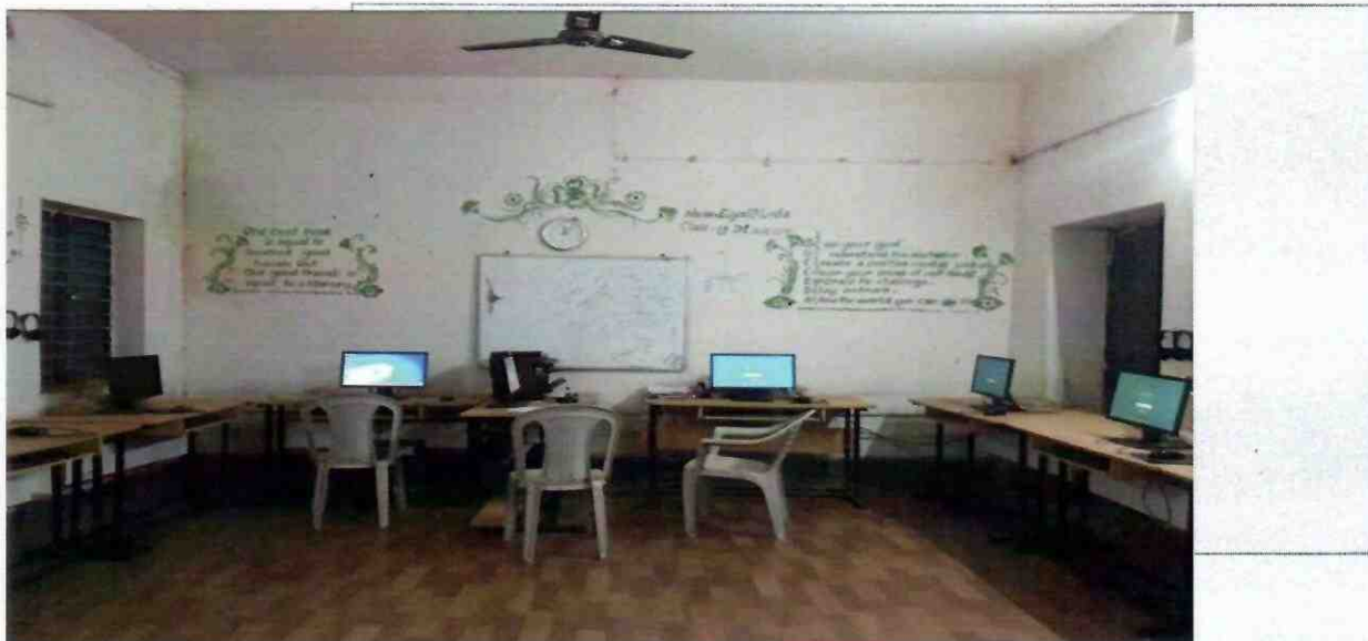
Photograph of functional ICT Lab:

[Signature] Headmaster Govt. High School, Durgma Sundargarh