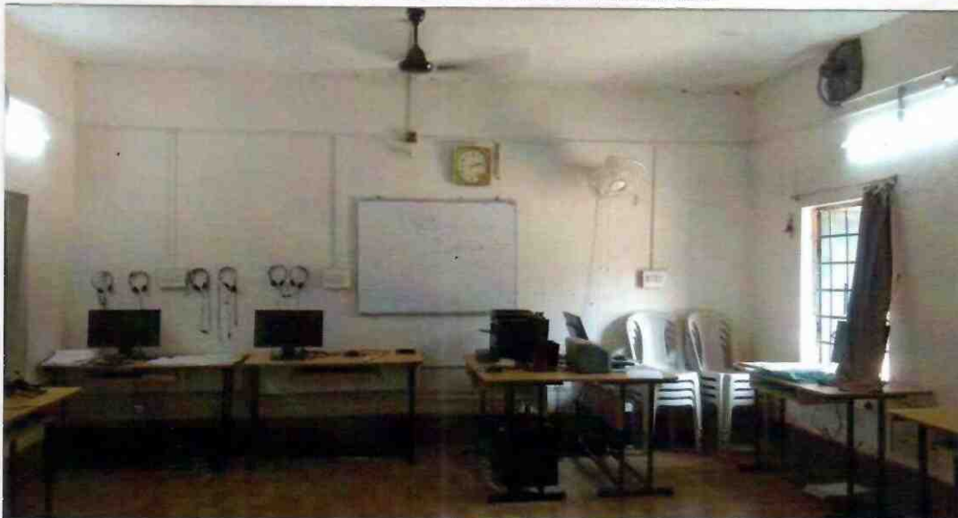
Photograph of functional ICT Lab: