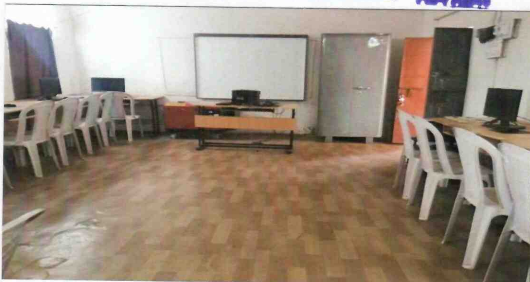
Photograph of functional ICT Lab:

[Signature] Headmaster Stamp: SRINIVAS JYOTI HIGH SCHOOL, BRABHAPUR, DIST-SUNBARGARH, PIN-751040