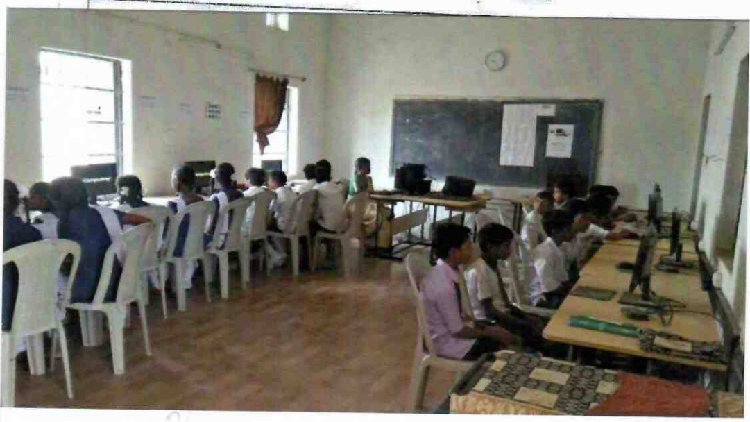
Photograph of functional ICT Lab:

[Signature] Head Master Govt. (SSD) Girls High School Ranto Birkera Stamp & Signature of HM